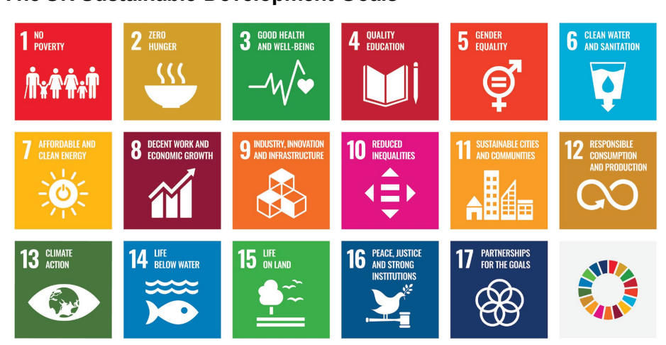
Figure 1: The UN Sustainable Development Goals