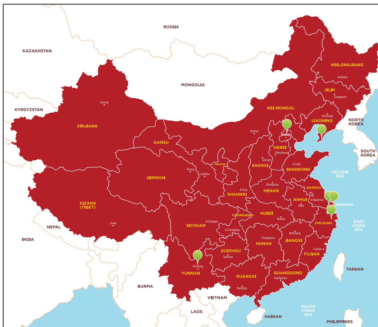
Map of Mainland China, showing the places included in the review team's itinerary: Beijing, Dalian, Kunming, Ningbo, Shanghai, Suzhou.

Following its review of transnational education in mainland China in November and December 2012, the Quality Assurance Agency for Higher Education (QAA) has compiled a set of four case studies dealing with different aspects of setting and maintaining academic standards. The review reports and an overview report on UK higher education delivered in China are published at: www.qaa.ac.uk/InstitutionReports/types-of-review/overseas/Pages/China-2012.aspx .