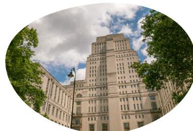
University of London