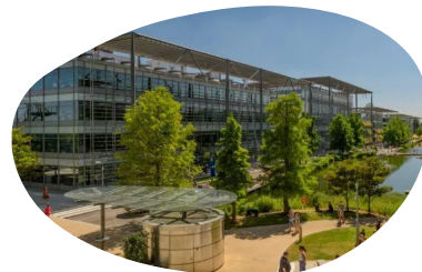
Richmond American University London