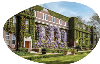
Regent's University London

Regent's University London, Inner Circle, London NW1 4NS