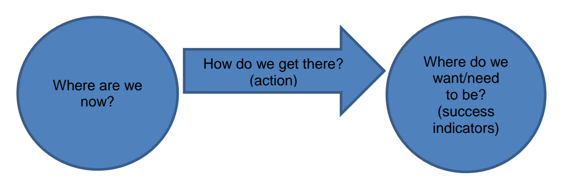
Figure 1: Completing the action plan

Before completing the action plan template, it might be useful to consider beginning with the end in mind. What would success look like? What will be different as a result of the actions taken?